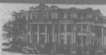
COURTHOUSE BUILT IN 1916