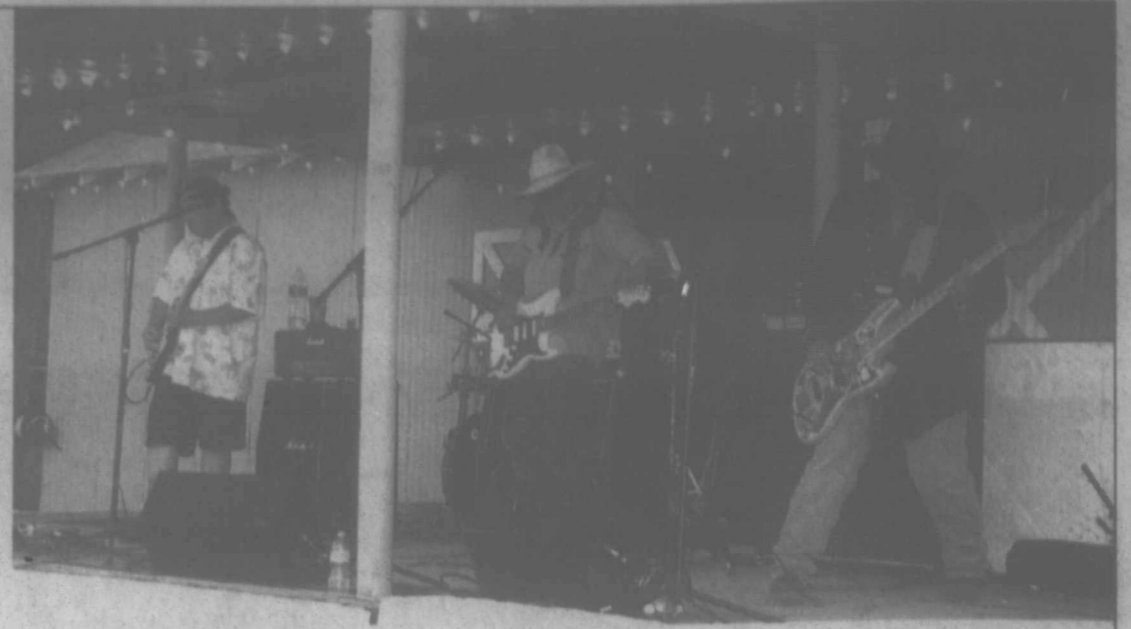
Good time at the music festival and chili cook-off ... Lots of RVs were parked at the site of the annual Chili Cook-off and Music Festival held last weekend in Tahoka. Shown here, some of the crowd gathers in front of the stage to listen to one of several bands who entertained during the two-day event.