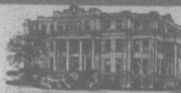
Courthouse built in 1916