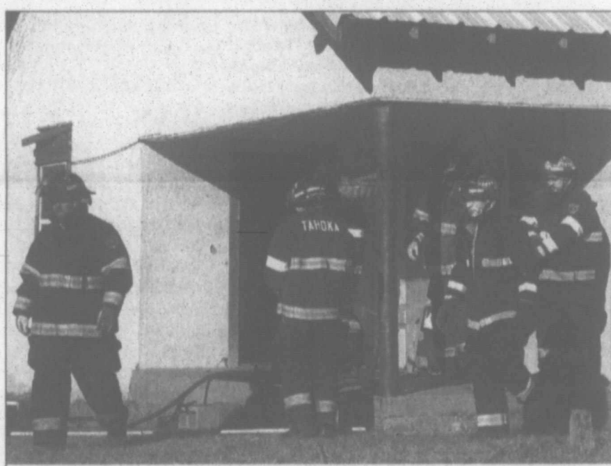
House fire... Tahoka Volunteer Fire Dept. responded to a house fire Tuesday afternoon, finding smoke pouring from the front doorway when they opened it. The house is located between Lockwood and South 1st, on Ave. M. No one was home at the time, and the fire was contained. No other information was available at press time.