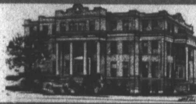
Courthouse built in 1916