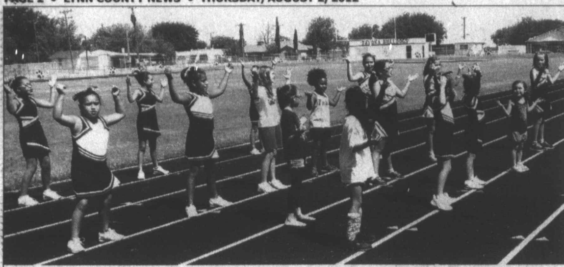
Cheer time ... Seagraves and Post Youth Football League cheerleaders cheer with some Tahoka girls at the South Plains Ironman Football Camp held Saturday in Tahoka.