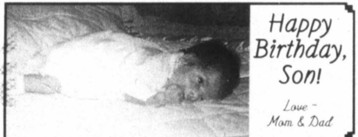
Happy Birthday, Son! Love - Mom & Dad