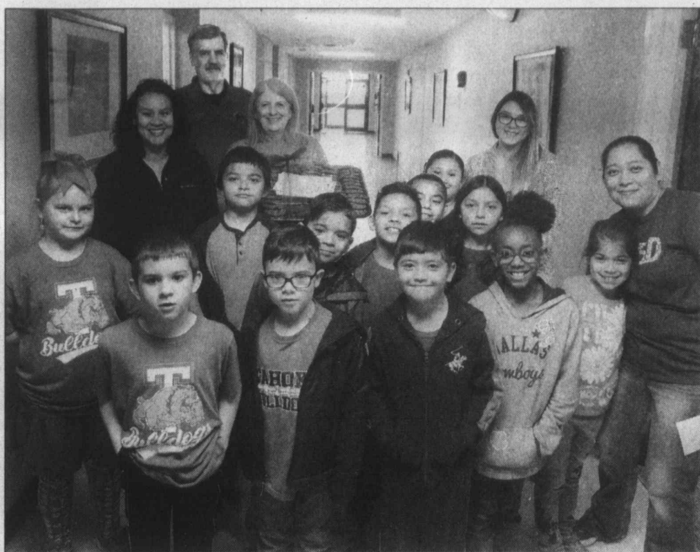
We like you! ... Tahoka ISD youth visited Lynnwood and Lynn County Hospital last week, working hard to make this world a better place. These third graders dropped off notes and cookies they decorated for LCHD staff and at Lynnwood. Elementary through high school grade levels participated in the day of service.