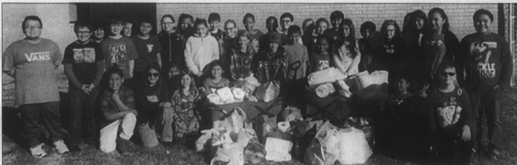
Serving the community ... Tahoka Elementary 4th grade classes collected non-perishable food items and non-food items for the Tahoka Senior Citizens Center last week. "We would like to thank the residents that live on N. 1st - 4th streets between Ave. P-R. Your generous donations are greatly appreciated," said a teacher.