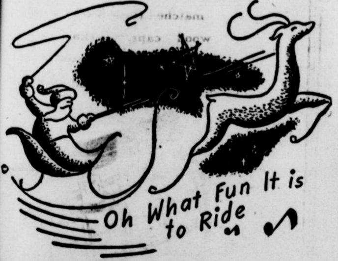
Oh What Fun It is to Ride