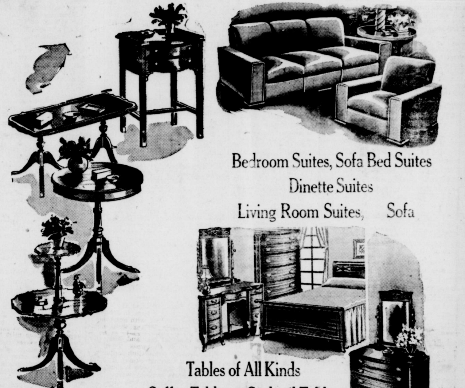
Bedroom Suites, Sofa Bed Suites Dinette Suites Living Room Suites, Sofa

Gifts for the home have always been the first choice of home-lovers as the practical solution for the gift problem. Although our stocks are not as complete as we would like, you will find many Gift Items to choose from.