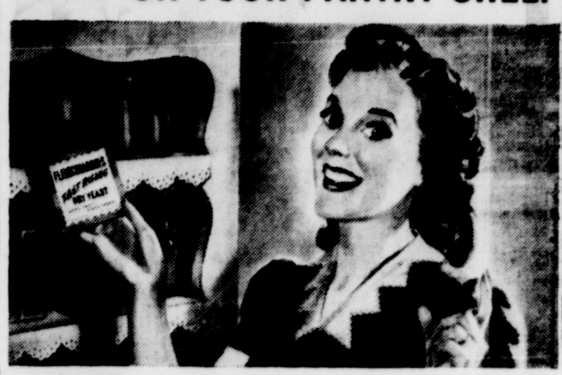
NOW! Bake any time ... at a moment's notice with New Fleischmann's Fast Rising Dry Yeast