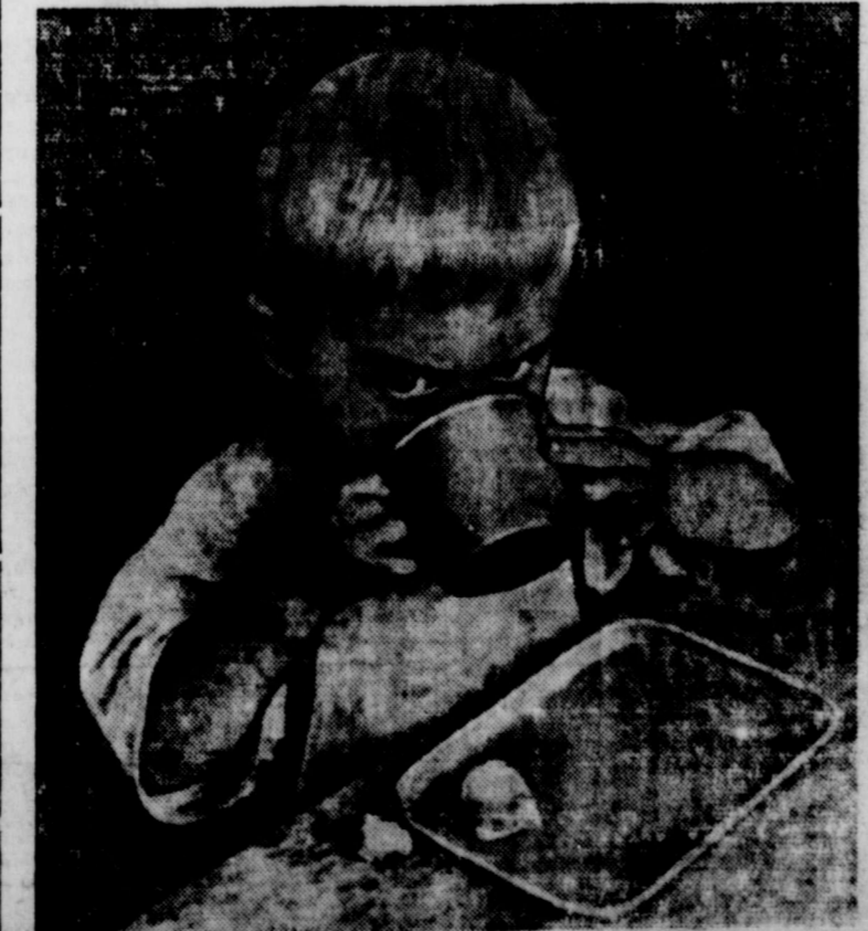
THIS CZECH YOUNGSTER seems to be afraid someone may take away his weak soup and bread. It is his one meal in the day. There are millions of others in Europe and Asia who have not even this meager ration. You can help save them from starvation by giving money or food in tin cans to the Emergency Food Collection.