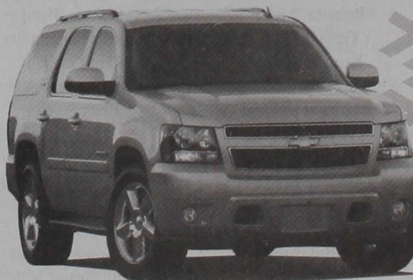
2013 CHEVY TAHOE

1.9% APR | for 60 months PLUS $500 Bonus Cash (for qualified buyers)