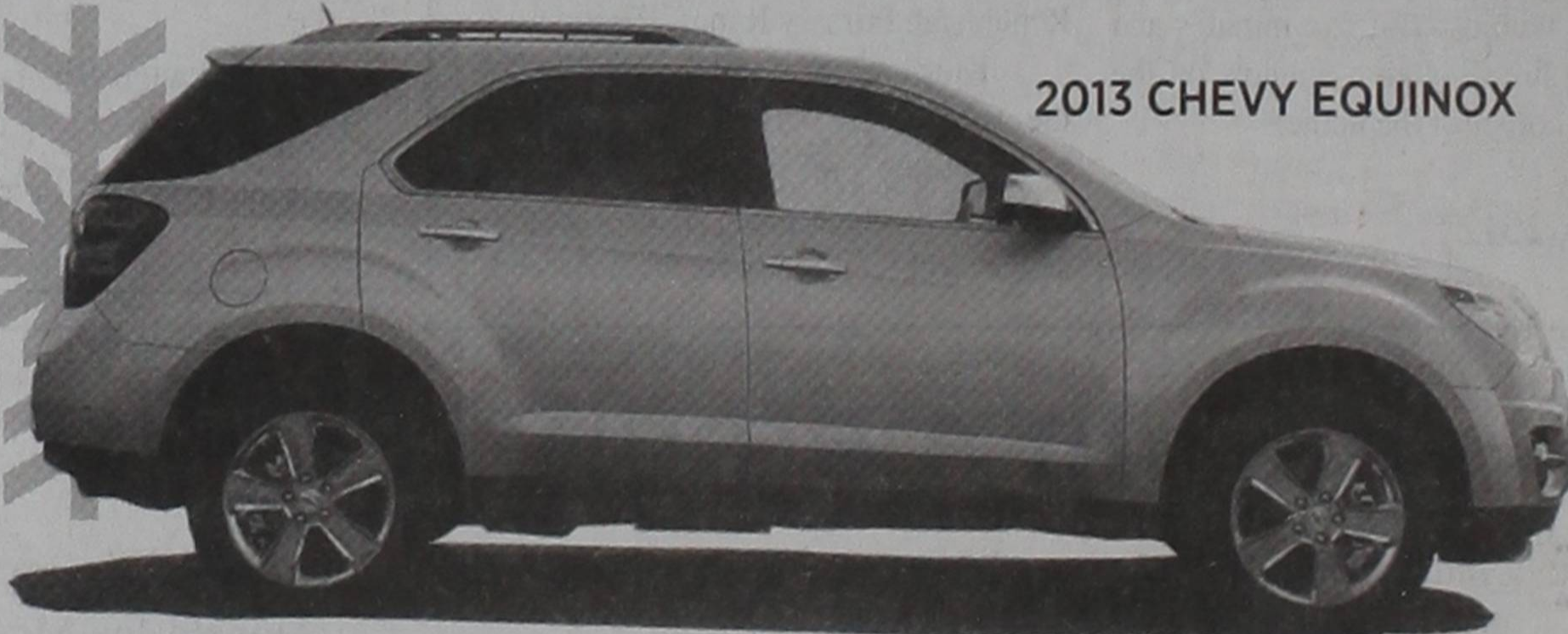
2013 CHEVY EQUINOX

1.9% APR | for 60 months PLUS $500 Bonus Cash (for qualified buyers)