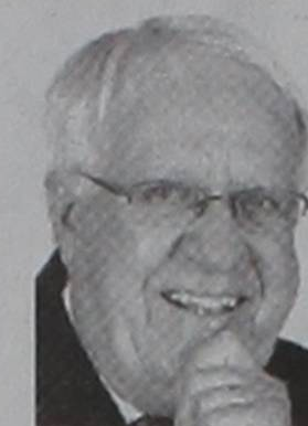
the idle american by don newbury

Thoughtfully, they've strung something like a clothes line across a wall. Visitors are invited to leave notes about their impressions, attaching them with miniature clothes pins. Dozens are "hung" each day, mostly by folks who