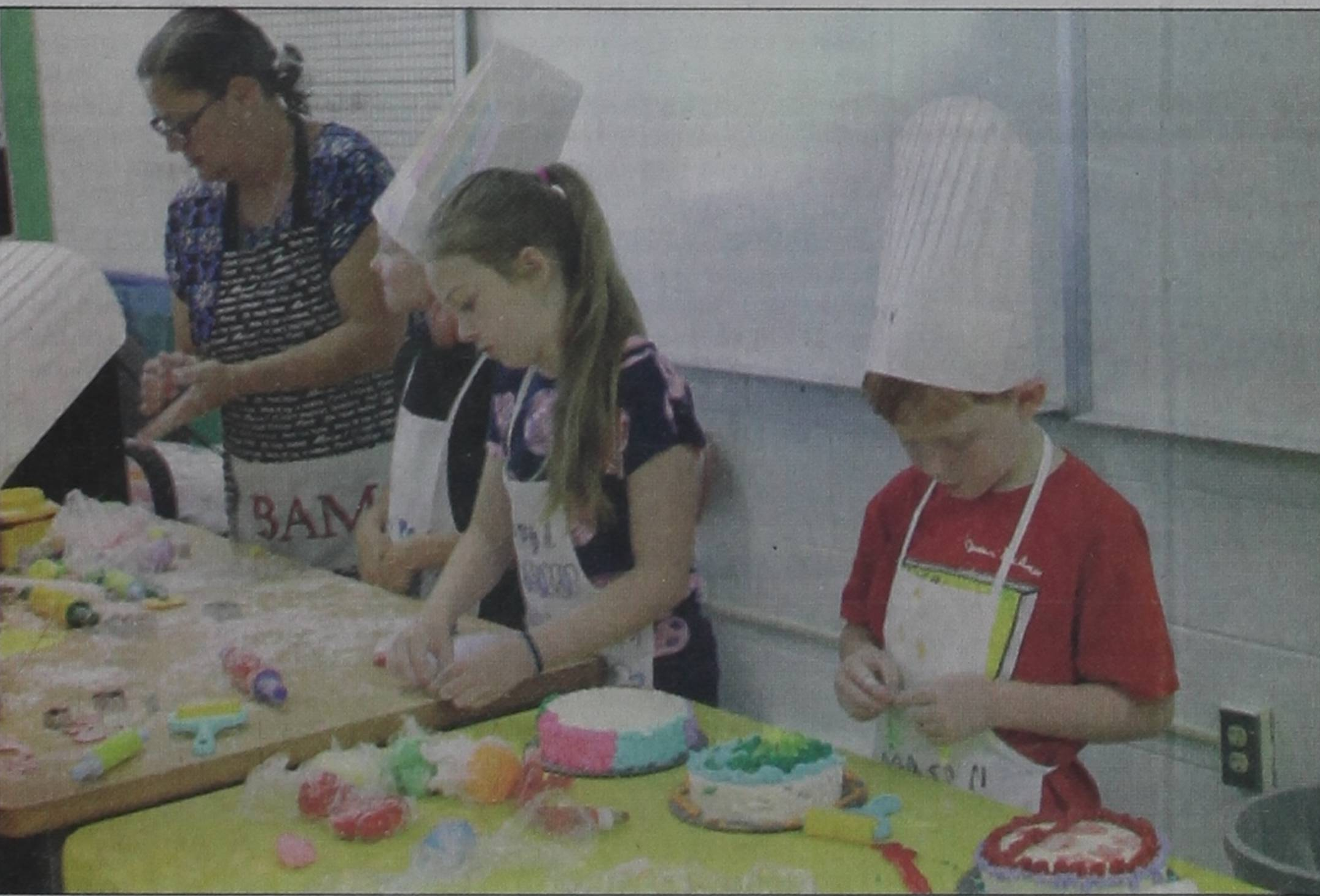
Make me a cake... Local kids got to try their hand at the art of cake decorating during Kids' College at Clarendon College Monday. Kids learned the different tools and techniques used to decorate cakes.