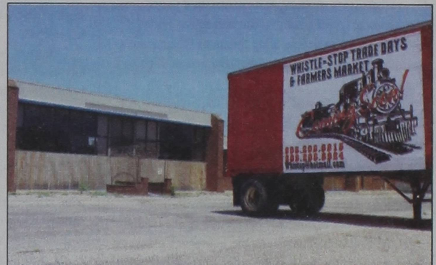
Plans are afoot to re-open the former Chamberlain Motors property as a trade days and farmers market location.

Vendors or local producers interested in having space at the Whistle Stop are asked to call 806-206-6815 or 806-206-6924 for more information.