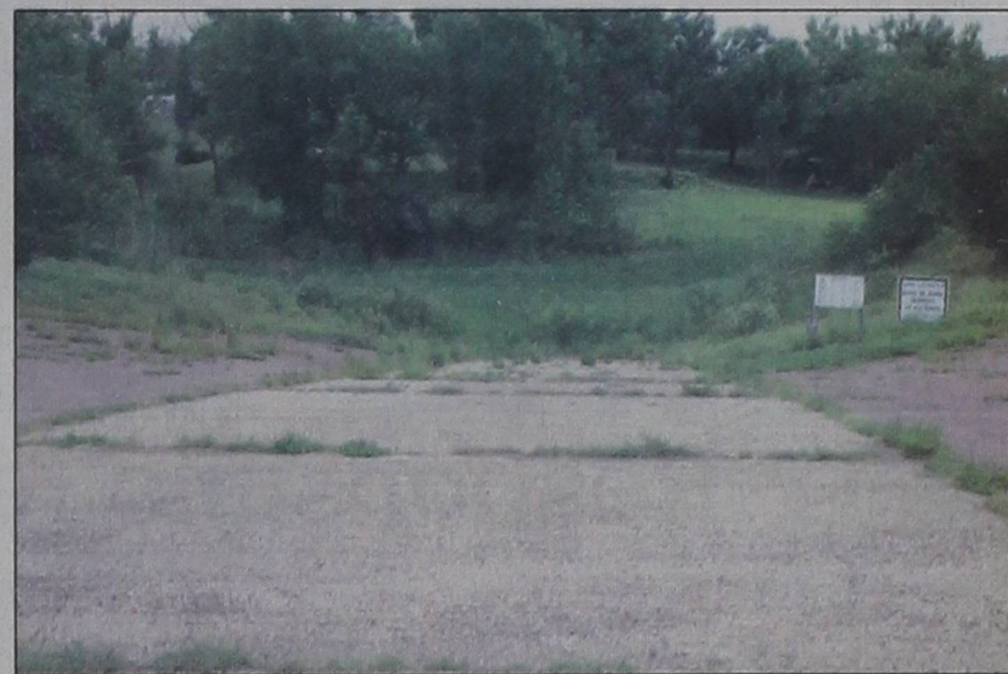
The boat ramp at Lakeside Marina is no where near the water of Lake Greenbelt, which needs several more rains.