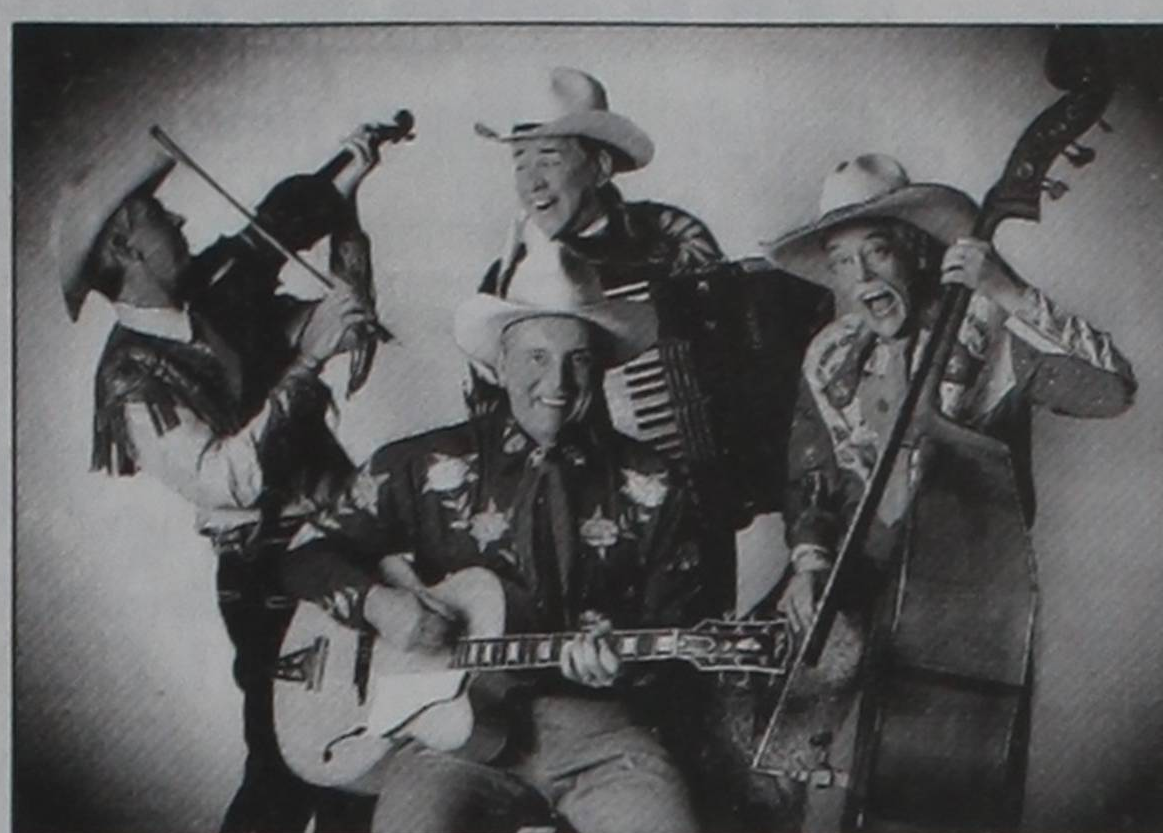
Riders in the Sky

WELLINGTON – The widely acclaimed Riders in the Sky will bring their long-haired brand of wit and western charm to the Wellington Ritz stage on Sunday, September 6 at 7:30 p.m. Guests may also enjoy an early start to the evening by chowing down on a catered dinner from Top Notch Texas Barbeque beginning at 6 p.m.