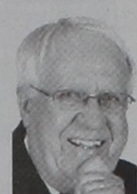
the idle american by don newbury