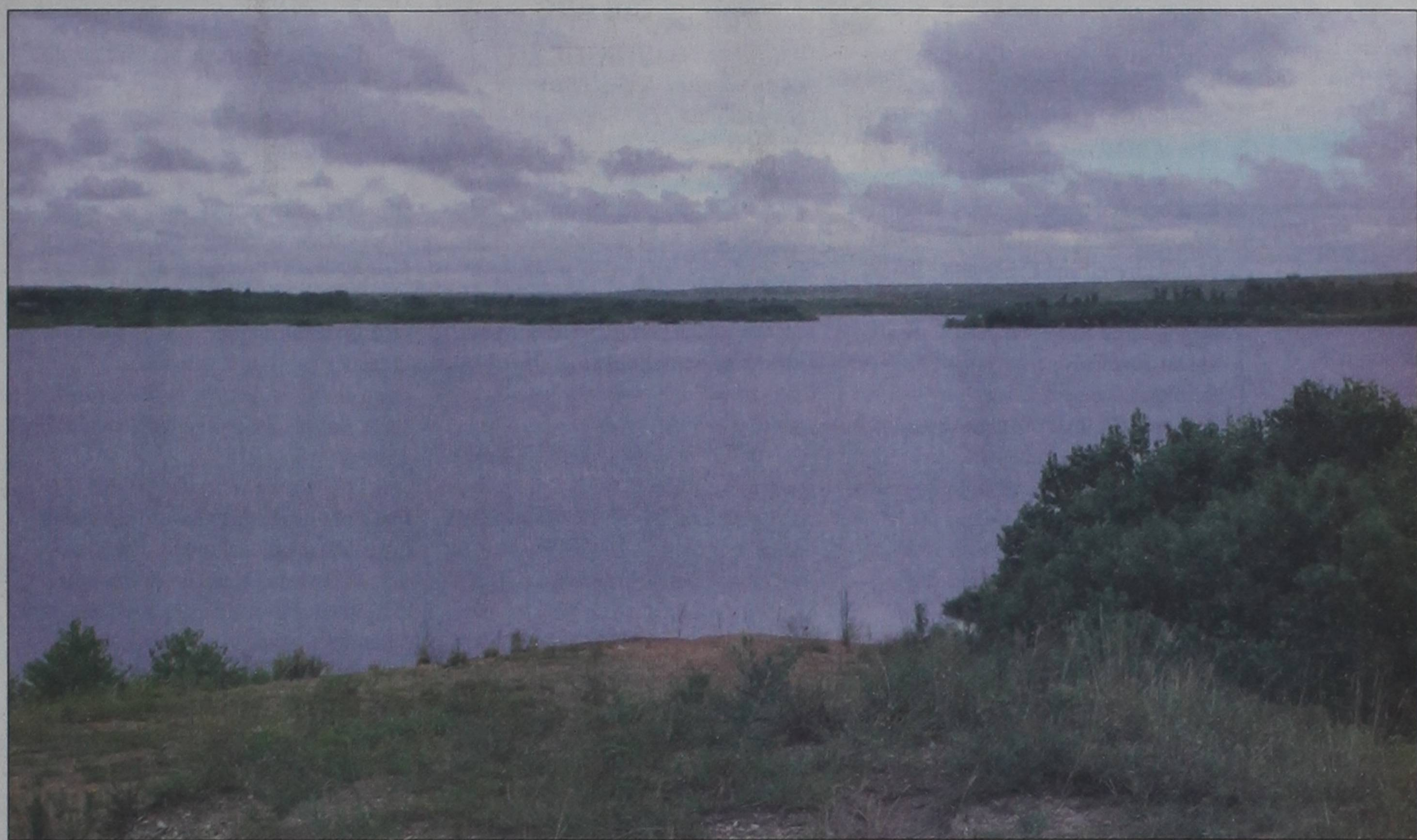
Greenbelt Lake has come up 11 feet this year but still needs another eight feet before it is completely out of drought conditions.

Clarendon College's fall semester classes begin Wednesday, August 26, and registration is now underway for academic and technical programs. Call the CC at 800-687-9737 for more information.