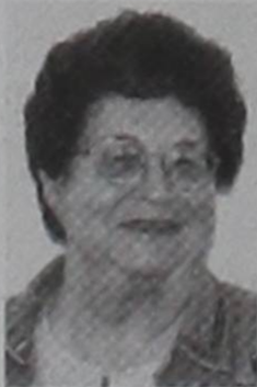
'wick picks by peggy cockerham Howardwick • 874-2886

If you have a need for food delivered to your door or could volunteer to deliver, please call the Senior Citizens at 874-2665.