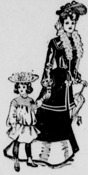
A Splendid Line of Long Coats.