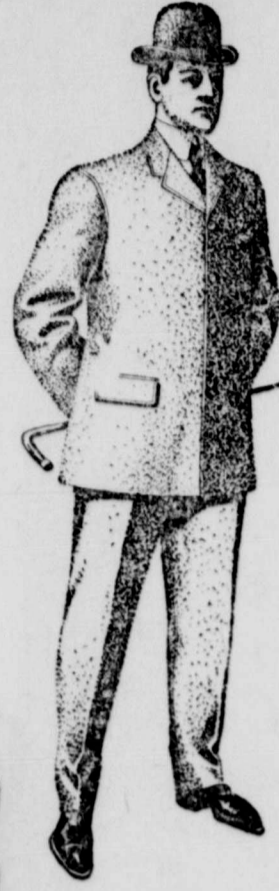
Winter Clothing for Men.