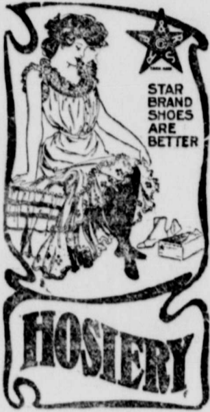
A new line of Hosiery.