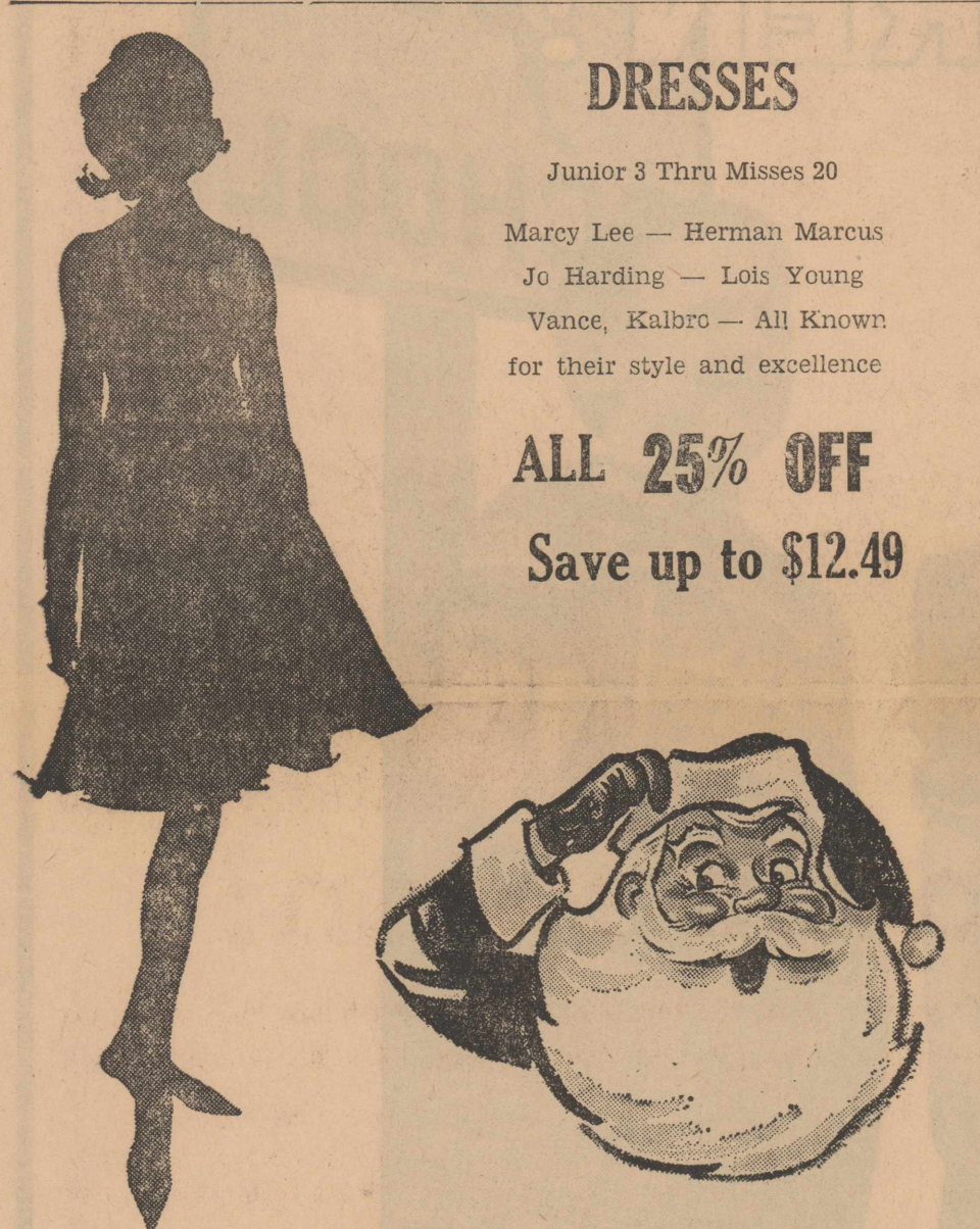
Buy Now and Enjoy Your Christmas Later

FREE COFFEE AND COOKIES OCTOBER 8-9 TO SAY THANKS For Allowing Us To Be a Part of Ozona For These 3 Most Enjoyable Years In Business Here