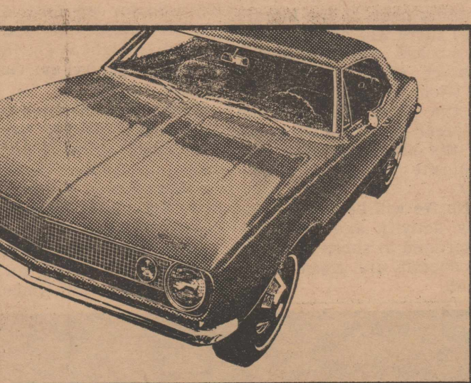
Take a Camaro, sport coupe or convertible.