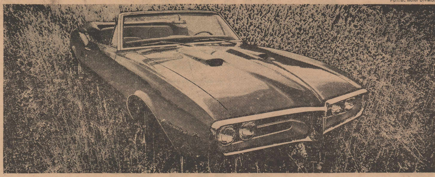
Pontiac announces not one, two, three or four, but five magnificent new Firebirds for every kind of driving.

advanced Pontiac styling, but with five entirely different driving personalities. And they all come with supple expanded vinyl interiors, wood grain styled dash, exclusive space-saver collapsible spare, bucket seats and wide-oval tires.