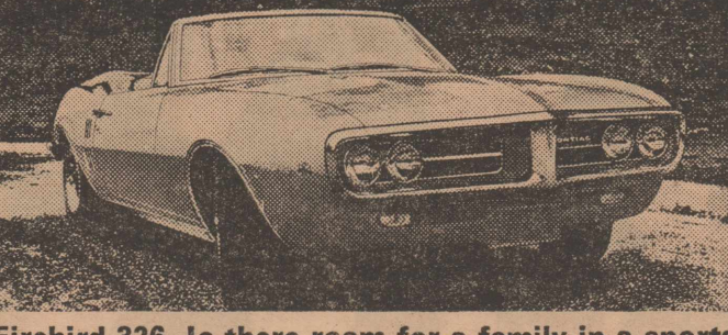
Firebird 326. Is there room for a family in a sports car? There is now. The excitement of a sports car with the practicality of a 326 cubic inch V-8 that delivers 250 hp on regular gas. Standard transmission is an all-synchro threespeed, but you can order an automatic.