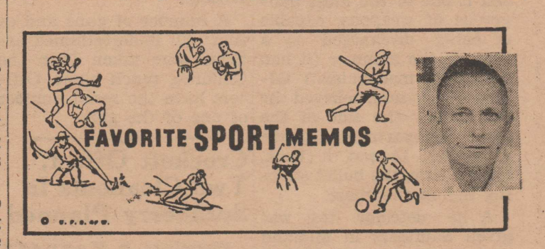
By A. R. Rutherford

For nearly one hundred years ice boating has been an organized sport in America, especially in those areas of the nation where severe winters prove a blessing in disguise for those whose tastes in sports run to the chill and nippy. In 1861 an ice yacht club was formed in Poughkeepsie, New York. This was the first formal organization of the sport. Actually there are records of ice boating in New Jersey back as far as 1850. But these early boats were crude and ungainly compared to such craft as the ice yacht "Icicle," nearly sixty-nine feet of racer which packed a walloping 1070 square feet of sail. In 1879 nothing on the Hudson River could touch her for