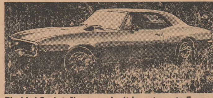
Firebird Sprint. Now you don't have to go to Europe for a sophisticated road machine. This is the 215-hp version of our eager Overhead Cam Six. It's mounted on special suspension that practically welds it to the road. (Any road!) With a floor-mounted all-synchro 3-speed.