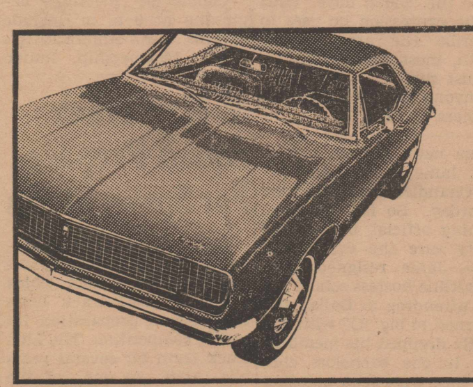
Make it a Rally Sport with hideaway headlights.