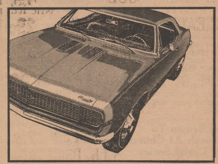
Or both: SS with Rally Sport equipment.