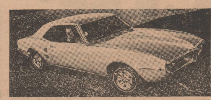
Firebird. This is our economy Firebird—with the same exciting options and interiors as the more exotic ones. It's Overhead Cam Six squeezes 165 hp from regular for inexpensive fun driving. See them all at your Pontiac dealer's.