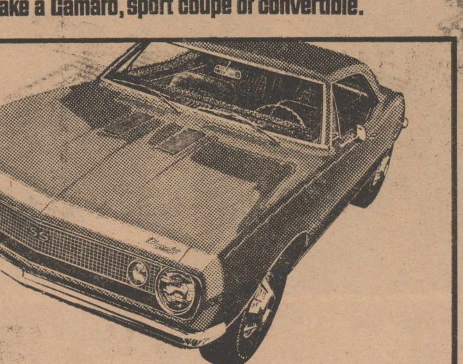
Make it an SS with Camaro's new 325-hp V8.