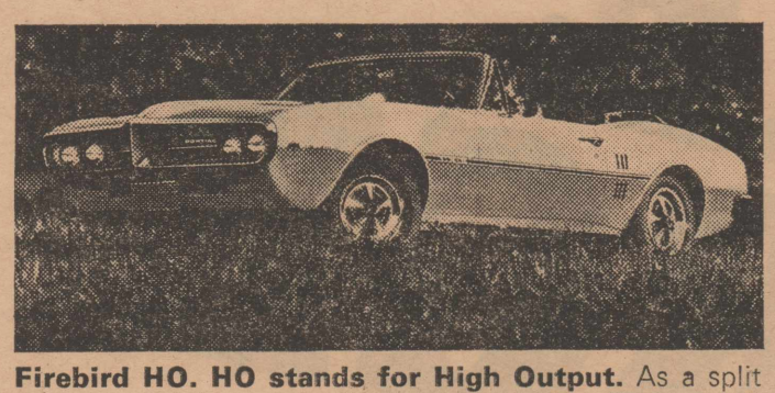
second behind the wheel will attest to. The Firebird HO boasts a 285-hp V-8 with a four-barrel carburetor, dual exhausts and sport striping. Standard stick is a column-mounted three-speed. Naturally, all Firebird options are available.

Now you can choose from five new Firebirds with the same Firebird 400. Coiled under those dual scoops is a 400 cubic inch V-8 that shrugs off 325 hp. It's connected to a floormounted heavy-duty three-speed. On special suspension with redline wide-oval tires. This could be called the ultimate in grand touring. After this, there isn't any more.