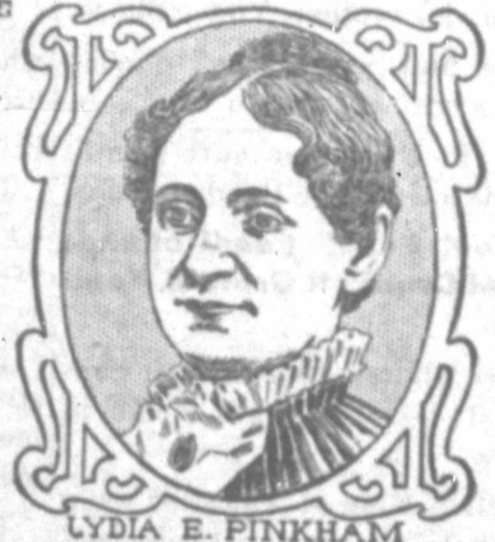
LYDIA E. PINKHAM

Is acknowledged to be the most successful remedy in the country for those painful ailments peculiar to women.