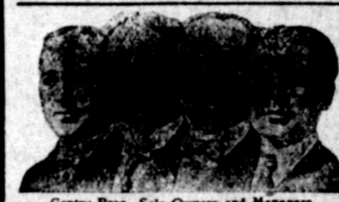
Gentry Bros. Sole Owners and Managers.

The 25th Anniversary Year of America's Standard Tented Enterprise now presents the Blue-Blooded Aristocracy of the White Tent World.