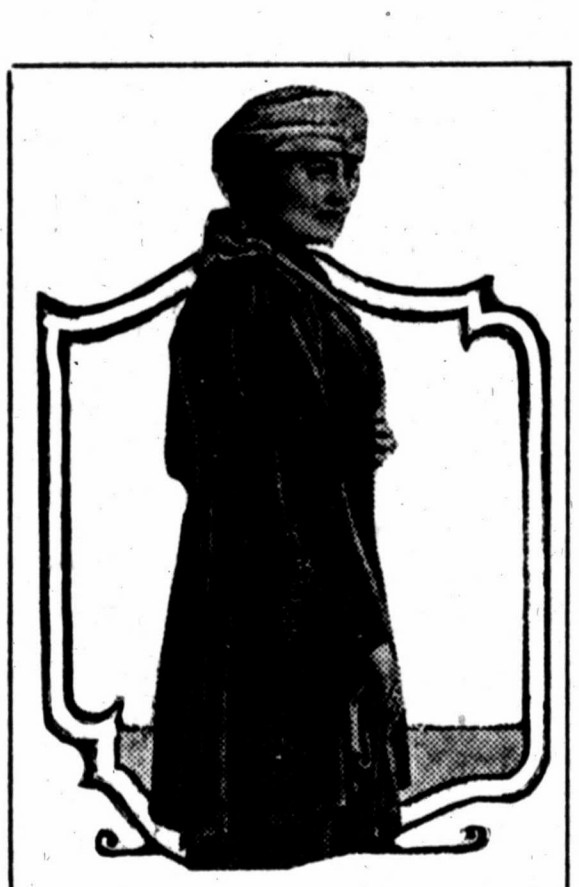
NEW FALL SUITS.

When one finds suits all ready to don, so full of the little touches which mark a suit as individual, it is good news to learn that the prices are so attractive as these we are making.