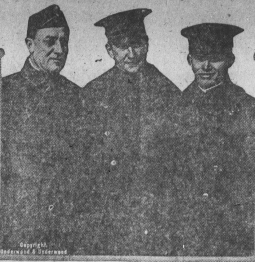
Six officers and sixty civilian employees have gone to Europe in connection with the bringing back to the United States of the bodies of our soldiers killed in France.