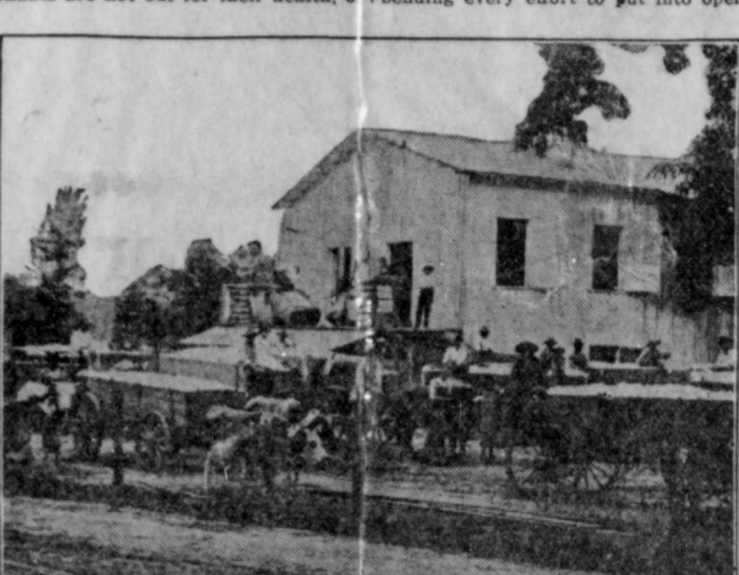
Scene at a Soul ern Cotton Gin.

The business interests of the cotton states have at last realized the needs as well as the advantages of the better methods. The merchants and bankers are fast requiring their customers to grow diversified crops enough to supply the home needs at least. This change will, of course, reduce the volume of business, but it will put things on a solid basis. And it is a poor business man who will not take a moderate profit as a surety rather than to look to the exorbitant rates surrounded with so many uncertainties, as has heretofore been the rule in the cotton sections. The farm- ability of putting a chandelier into the er himself has begun to recognize the schoolroom. Every one seemed in advantages of the change, and is now favor of the idea. chants are not out for their health, o' bending every effort to put into oper-