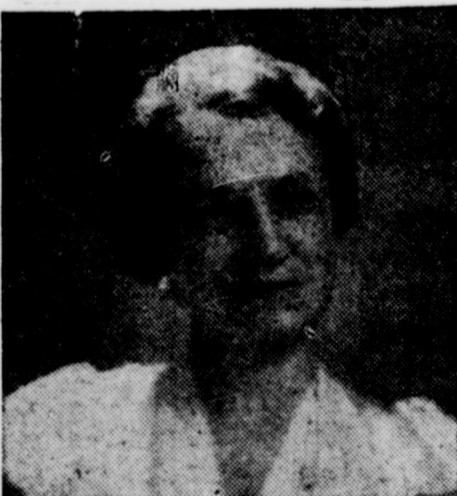
Mrs. George C. Marshall