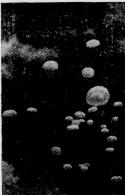
PARACHUTE TROOPS SEE ACTION!

U. S. Parachutists float earthward from troop carrying planes as an effective means of landing behind enemy lines and disrupting his communications. This scene was repeated many times as the invasion got under way.