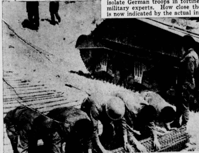
"GOING TO THE MAT" IN EUROPE

Allied troops are equipped for gas attacks. The job of making gas masks was speeded up by the use of gypsum cements, which have been used widely to make patterns and models for many vital war materials.