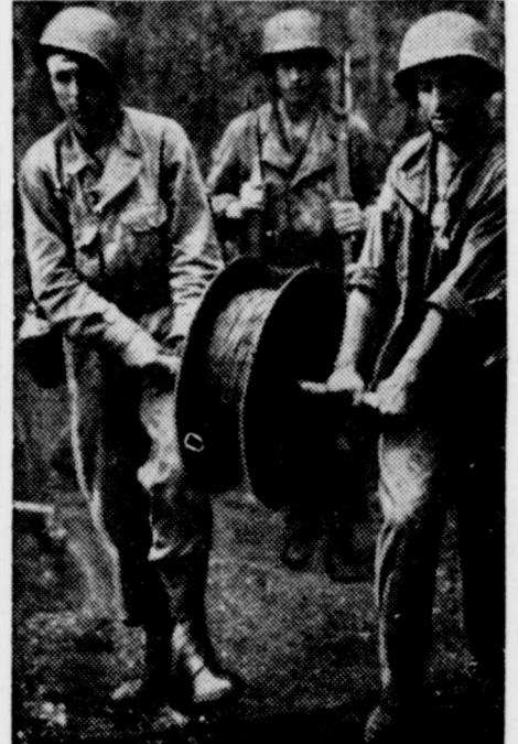
Reeling out wire from an RL 31 in the steaming jungles of New Georgia--rain, insects and the ever-astounding muck. The jungle is definitely Jap infested as well, but your War Bonds can be a mighty effective Jap insecticide. Buy them and hold 'em! U. S. Treasury Department