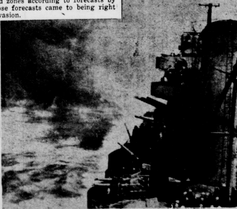
BATTLESHIPS BLAST INVASION COASTAL AREAS

British sappers, above, are laying a piece of "portable highway" to permit safe passage for transports and tanks as they land on European shores. Bundles of steel landing mats are unloaded from ship to shore, to form highways to speed men, munitions and guns to the front line fighting. Landing fields are quickly completed this simple way, too. Steel mats, many of which are made by United States Gypsum Company, are one of the innovations of this war. When the war ends this USG production will be returned to metal lath, used widely with gypsum plaster to add fire-safety and beauty to walls and ceilings.