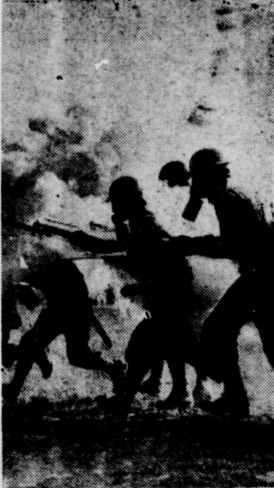
GAS WON'T STOP THEM

Invasion moves as depicted on the map above were planned to isolate German troops in fortified zones according to forecasts by military experts. How close those forecasts came to being right is now indicated by the actual invasion.