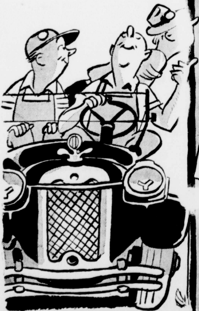
Gasoline powers the attack... Don't waste a drop!

This plan was conceived by experts in car care. Gulf developed it because car maintenance is a most important civilian job.