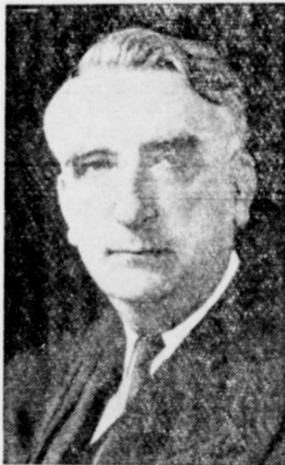
WASHINGTON, D. C.—(Sound-photo)—Secretary of the Treasury, Fred M. Vinson, selected by President Truman to be the new Chief Justice of the Supreme Court, is shown, above, in his robes when he was Associate Justice of the Court of Appeals.