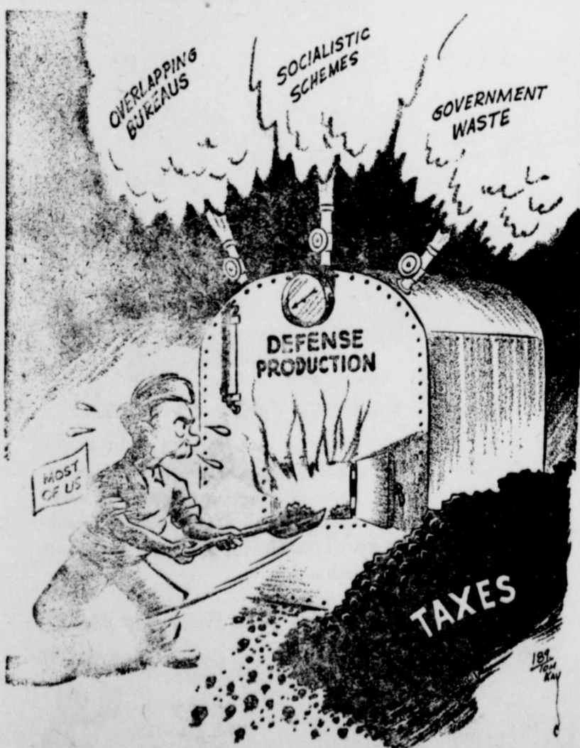
Close Those Valves