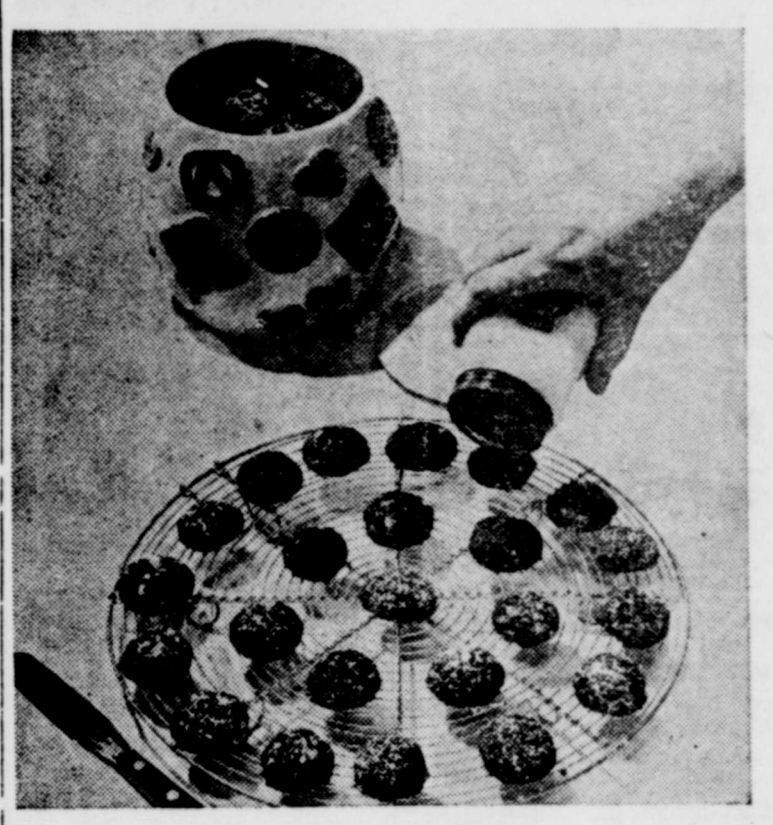
By BETTY BARCLAY

a mighty comfortable feeling to have a cooky jar filled to the brim, dy to yield its toothsome contents to satisfy between meals appetite or to linterest to a simple fruit dessert. And if they're these nut filled chocolate