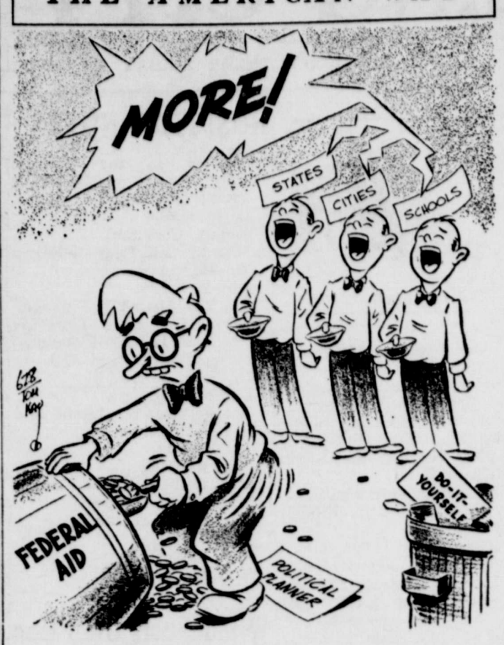
Passing the Buck(s)!