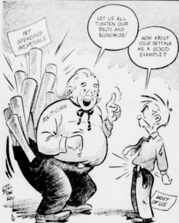
Yes—How About That?