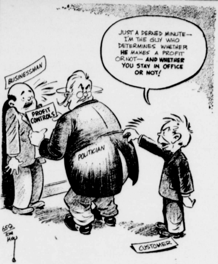
"The Customer Is Always BOSS!"

What is keratolytic action? It is the sloughing off of an infected skin exposing more germs to the kill. Instant-drying T-4-L is a liquid keratolytic sold at all drug stores. If not pleased in 3 days your 48c back at Long Drug Co.