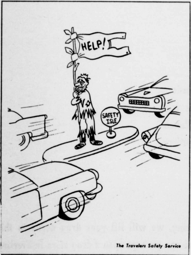
Almost 250,000 pedestrians were killed or injured in motor vehicle accidents in 1959.