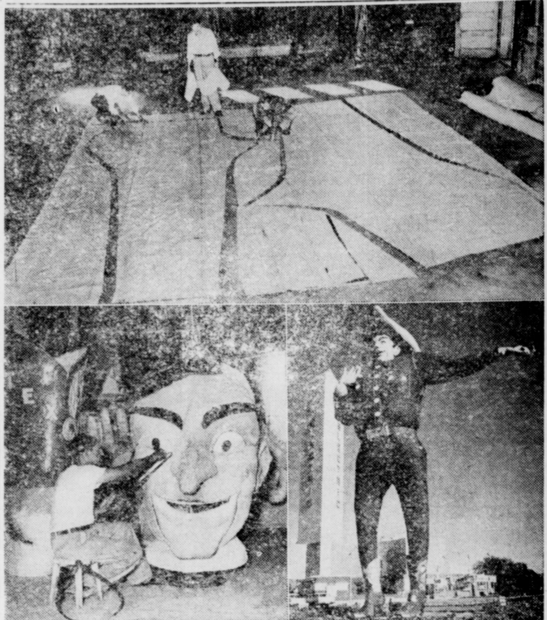
They're getting "Big Tex," 52-foot cowboy "mascot" of the State Fair of Texas, ready for the Fair's big Diamond Jubilee Exposition Oct. 8-23. Top, cutting out material for Tex's giant-size blue jeans. Lower left, touching up his face. Lower right, the big fellow himself as he'll look at the Fair.