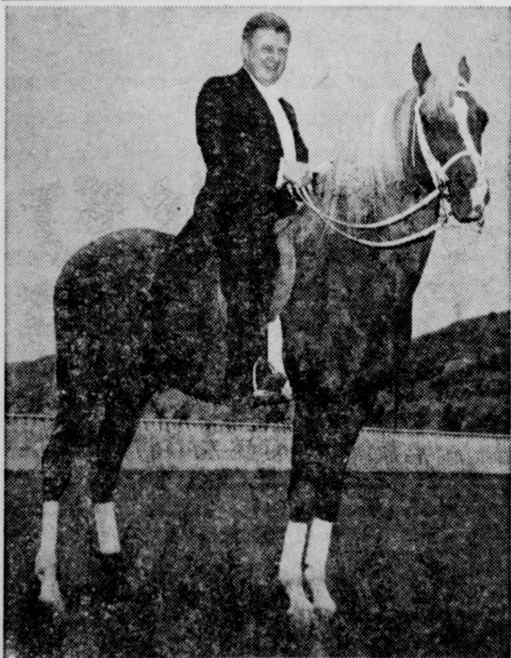
Arthur Godfrey, popular television and radio personality, will appear with his famous Palomino, "Goldie," at the 1960 State Fair of Texas Horse Shows in Dallas Oct. 7, 8 and 9 in the Livestock Coliseum.