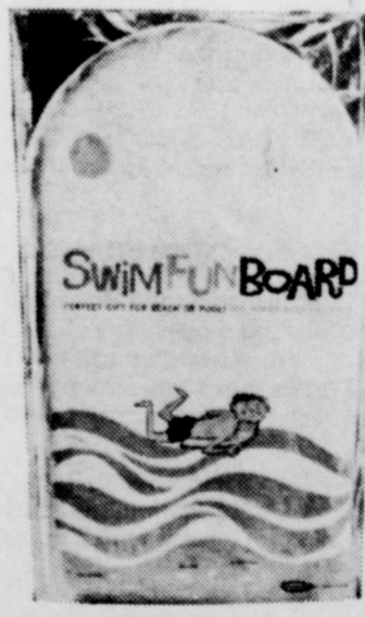
14" X 24"

and a fill-up of Cosden POWER RATED GASOLINE