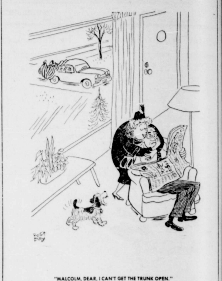
"MALCOLM, DEAR, I CAN'T GET THE TRUNK OPEN." The Travelers Safety Service

Women drivers were involved in more than 18% of the personal injury accident in 1960.