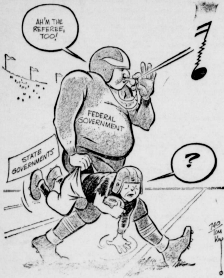
CANT WIN - CANT EVEN SCORE