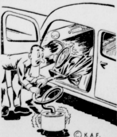
Wow - That's really cleanin' the seat covers!