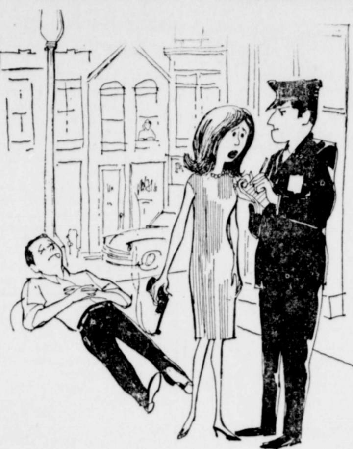
"I just couldn't stand that 'greasy kid stuff' another minute."

Sunday Mass (Oct. thru Mar.) 1:00 p.m. (Apr. thru Sept.) 12:15 p.m.