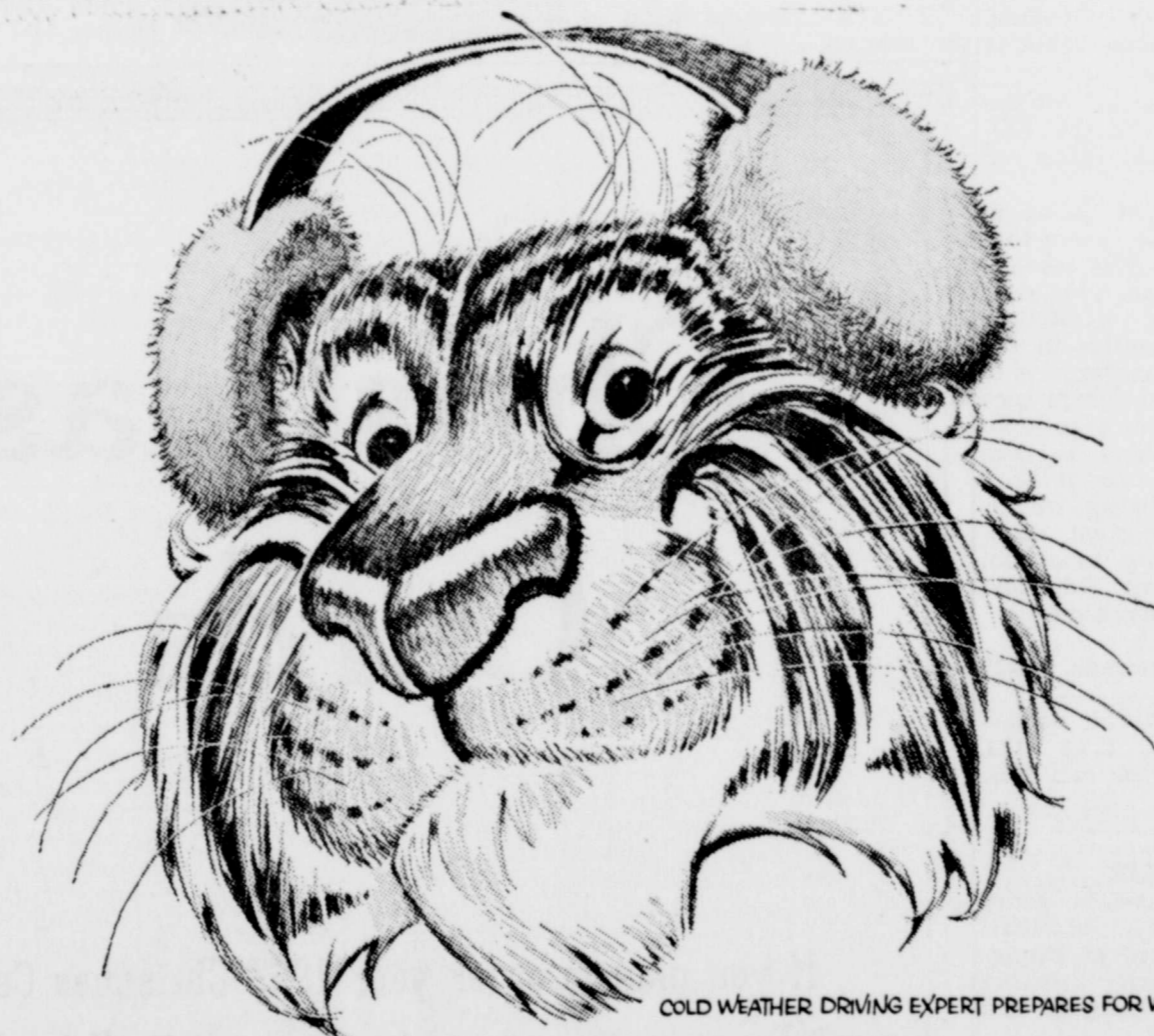
COLD WEATHER DRIVING EXPERT PREPARES FOR WINTER