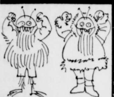
HARDY bacteria that can exist in temperatures up to 170 degrees F. and in arctic regions are being studied at Purdue University. Biologist Henry Koffler says their immunity to extremes and chemicals is due to their cellular structure.