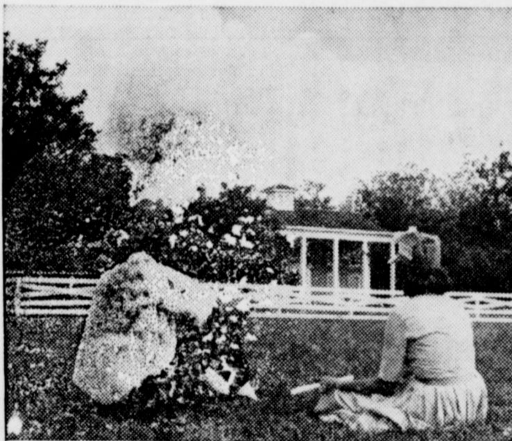
CCV. JIM HOGG'S HOME — Texas tourists visit sugar plantation home of one of the state's great governors, James S. Hogg (1891-1895) in Brazoria County, located in Varner-Hogg Plantation State Park.