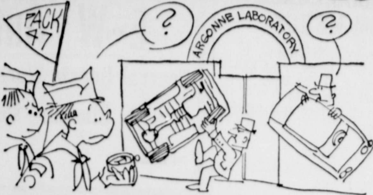
A MAGNET with 88,000 times the strength of the magnetic field of the earth has been developed at Argonne National Laboratory. It is doughnut-shaped and 24 inches in diameter.