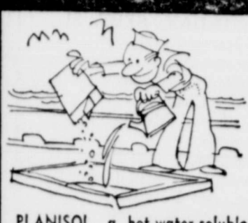
PLANISOL , a hot-water-soluble compound that can emulsify any known oil, makes sterilization of cargo compartments of ocean-going tankers a simple job, reports Northwest Chemical, Detroit. The quick sterilization enables ships to carry crude oil on one leg of a trip and edible oil on the return.