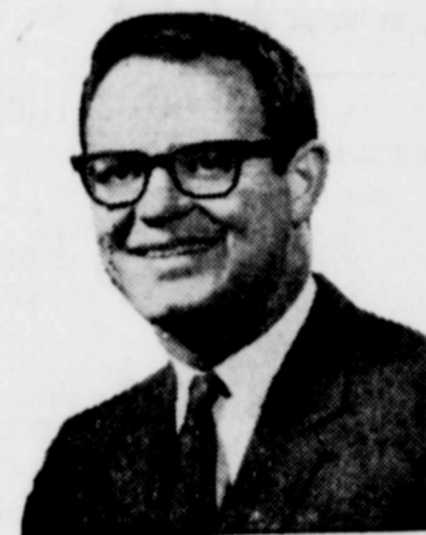
(Pd. Pol. Adv.)