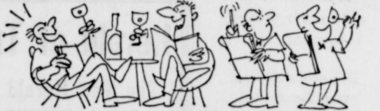
CARTOONS and cocktails are giving University of Wisconsin psychologists added knowledge of human behavior. The psychologists have developed a method of using humor and alcohol to reveal personality traits.