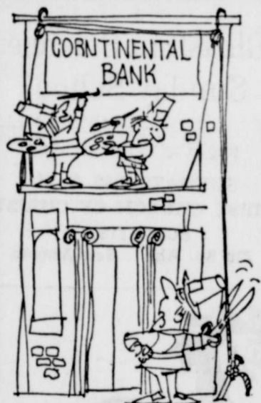
EARLY colonists of America often used corn as a medium of exchange instead of money.

THE SATURN ROCKET must be fed fuel pressurized by compressed helium, which is inert and will not react with the propellant or plumbing. Philadelphia Forge, Philadelphia, which machined containers to hold the helium, says the light weight gas is stored in aluminum "bottles" 211.8 inches long, 19.1 inches in diameter and 0.90 inches thick. Despite their size the four containers required for a firing are almost lost inside the rocket's huge liquid oxygen tank.