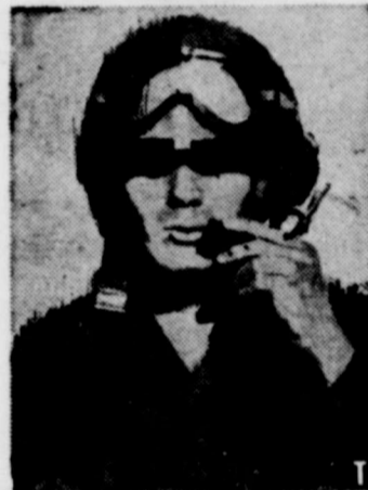
The U.S. Army Reserve.