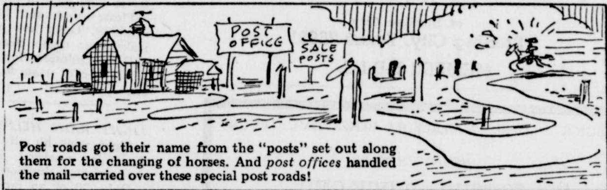
Post roads got their name from the "posts" set out along them for the changing of horses. And post offices handled the mail—carried over these special post roads!