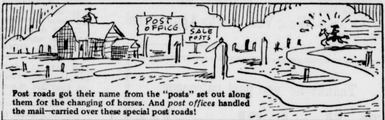
Post roads got their name from the "posts" set out along them for the changing of horses. And post offices handled the mail—carried over these special post roads!