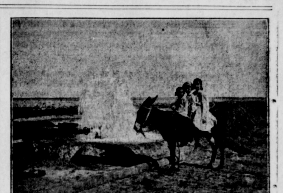
Where the Snow-White Geysers Raise Their Frosted Crests.