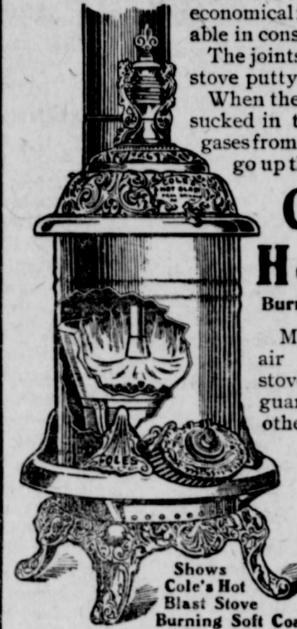
Shows Cole's Hot Blast Stove Burning Soft Coal

Made without stove putty. It remains air tight during the entire life of the stove, and is sold under the following guarantee, which cannot be made on any other heating stove in the world: