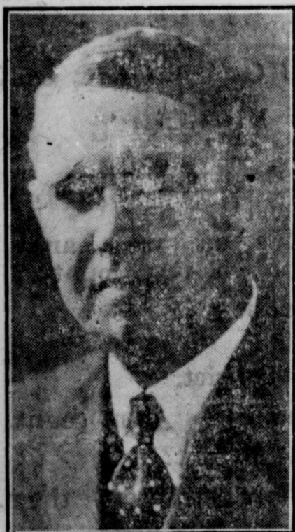
STEPHEN B. DAVIS, JR. Republican Candidate for United States Senator