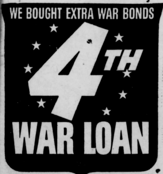
This sticker in your window means you have bought 4th War Loan securities