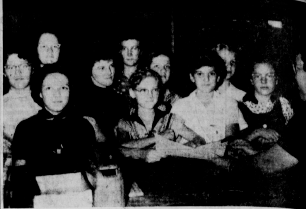
GIRL SCOUTS place a classified ad in the Advocate offering their services for the planning of children's parties.