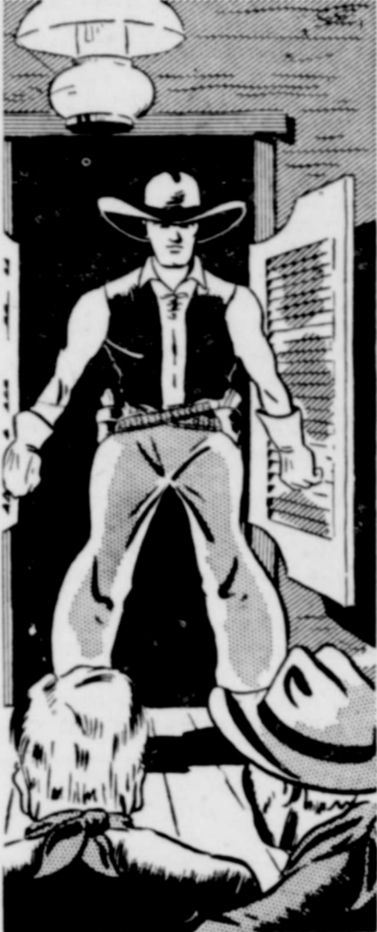
He pushed open the batwing doors and stepped into the brightly lighted interior.

The blind man falteringly reached out a hand, fumbled a bit, then placed the