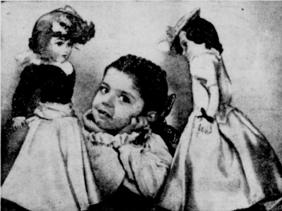
NOW THIS IS GOING TOO FAR . . . All right, so the revolution is upon us; the long skirt is here to stay and no one can do anything about it. But when fashion designers carry their insidious plot to the extent of emmeshing innocent children in their toils—that's just too much. The dread secret came out at the American Toy institute show in New York: Even dolls are wearing wasp-waisted, long-skirted outfits now.