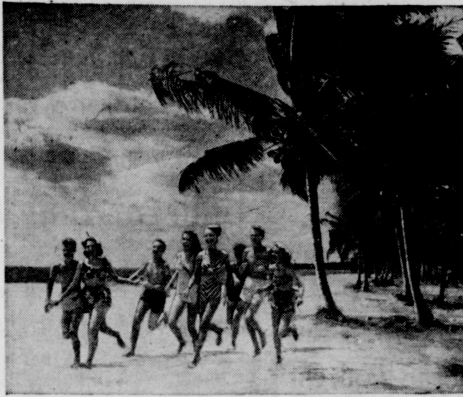
NEW PALEFACE HUNTING GROUNDS . . . In the exotic tropical setting of Key Biscayne, once an Indian hunting and fishing ground, pleasure-bent palefaces now find easy hunting in their quest for rest, relaxation and recreation.