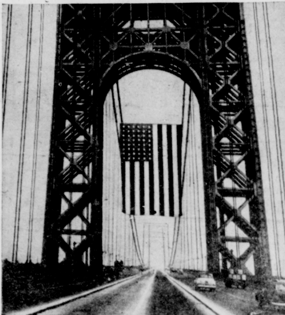
MAMMOTH FLAG DRAPES BRIDGE . . . Largest American flag ever to be flown freely, according to Port of New York authority, is this 60 by 90 foot Old Glory hanging from the New Jersey tower of the George Washington bridge spanning the Hudson river. It took 19 men using four winches to lift the flag's 560 pounds and two and one-half tons of guy ropes.