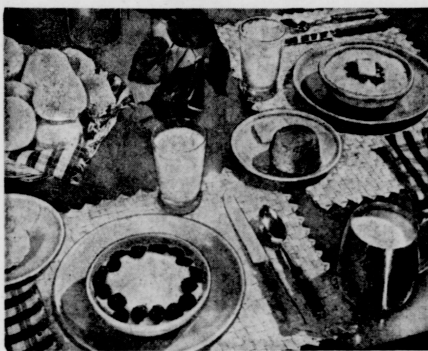
Good Breakfasts Put Pep into Work (See Recipes Below)

Teen-Agers' Breakfast IN THE HUSTLE and bustle of school work and social activities, teen-agers are apt to short-change themselves on the food they eat. Their stomachs aren't going empty; but, considering between-meal snacks of candy bars and soft drinks, the kind of food they eat is apt to be off the track as far as good nutrition is concerned.