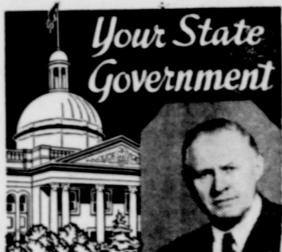
By Thomas J. Mabry GOVERNOR

A verse for today: "So will I seek out my sheep and will deliver them out of all places where they have been scattered in the cloudy and dark day." —Ezek. 34:12.