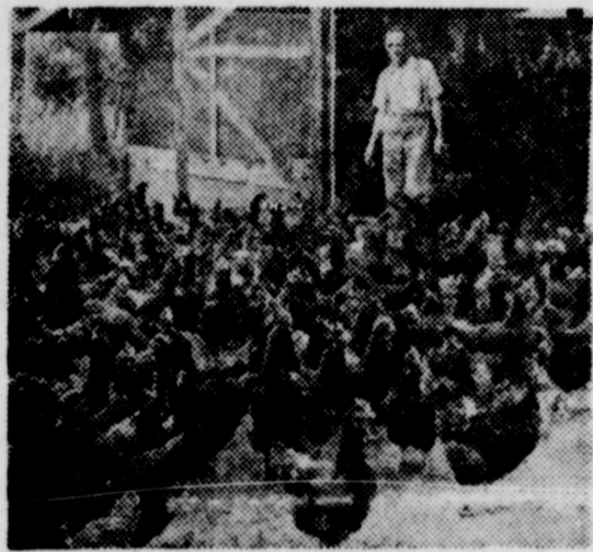
More and more flocks like the one above will be seen on the nation's farms this year.

Poultry production gains have far outdistanced the U.S. population increase. That means some huge jumps in per-capita consumption.