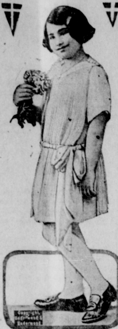
This charming little dress for a child of ten is a fashion direct from Paris. It is of rose crepe marocain, plaited and girdled with tiny roses.

after several years of comparative unpopularity—but it has a dangerous rival in those sheer crepes with shadow check and cross-bar and stripe designs, but one may buy imported voiles and cotton crepes strewn all over with embroidered designs.