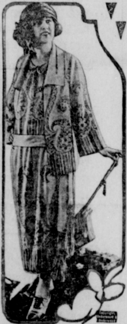
This chic three-piece suit for outdoor wear is of "chummy crepe" with a bold hand-blocked Persian motif.