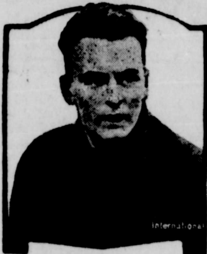
Above is pictured Prince Olaf of Norway, a member of the Balliol college crew, ready to take off for a spin on the Thames. He is an ardent oarsman and active in the early training of the Oxford crews.