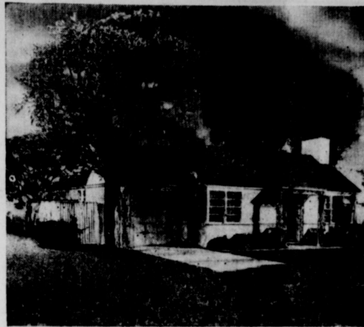
A COOL COURT IS ONE of the many pleasing features of the modern low cost home shown above. Bright, breeze-swept rooms, pleasant views through spacious windows and a step-saving plan are other features that make this house a happy solution to the housing problems of many average American families.

"Section 7-a. Subject to legislative appropriation, allocation and direction, all net revenues remaining after payment of all refunds allowed by law and expenses of collection derived from motor vehicle registration fees, and all taxes, except gross production and ad valorem taxes, on motor fuels and lubricants used to propel motor vehicles over public roadways, shall be used for the sole purpose of acquiring rights-of-way, constructing, maintaining, and policing such public roadways, and for the administration of such laws as may be prescribed by the Legislature pertaining to the supervision of traffic and safety on such roads; and for the payment of the principal and interest on county and road district bonds or warrants voted or issued prior to January 2, 1939, and declared eligible prior to January 2, 1945, for payment out of the County and Road District Highway Fund under existing law; provided, however, that one-fourth (1/4) of such net revenue from the motor fuel tax shall be